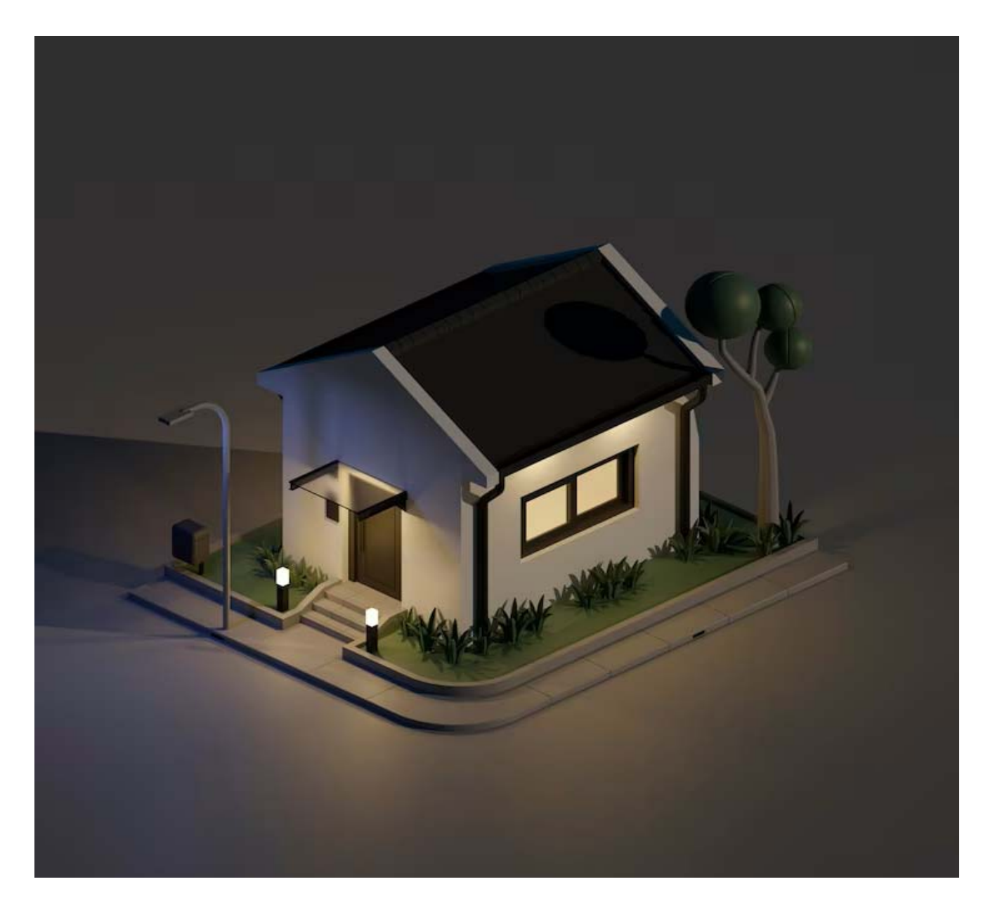
22<sup>ND</sup> ANNUAL REPORT 2022-23